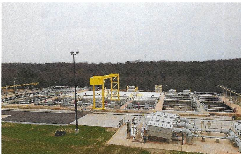
Overview of the plant